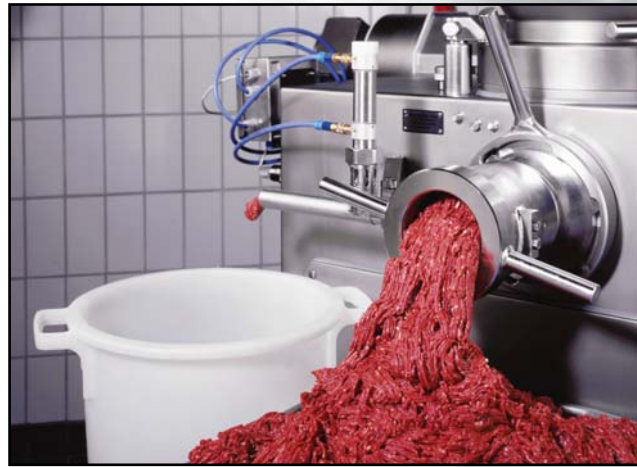
Separation grinder 982 with automatic separation valve

By removing rind and sinew, the quality of the production meat is already considerably enhanced at the grinding stage – and this for a throughput rate which can be as high as 8.7 tons per hour. The portioning device of the ROBOT HP-series vacuum fillers ensures that raw material is portioned as it is ground and separated; subsequent weighing operations can be dispensed with.